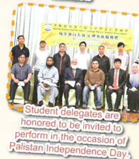
Student delegates are honored to be invited to perform in the occasion of Pakistan Independence Day.

The audience was quite Multi-Cultural too. We were honored with the presence of teachers and students from 115 Junior High School in Jakarta, IVE in Chai Wan and Islamic Primary School in Tuen Mun. We have arranged around 25 booths which demonstrated different cultures, clothing, food and games. Thanks to the consulates, NGOs and many other different organizations in providing materials and setting up their booths for the colourful event. We were also glad to see our guests, teachers and students dressing in their traditional costumes, the atmosphere was harmonic, festive and colourful.