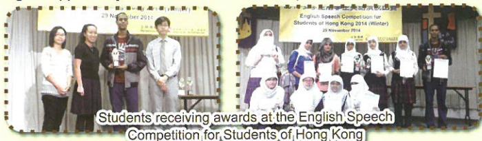
Students receiving awards at the English Speech Competition for Students of Hong Kong

Our students participated in two separate English public speaking competitions organized by the Hong Kong Talent Star Youth Association. 3 of our students won top 3 positions while 6 of them received merit awards. Our school also won the overall championship in both the summer and winter sessions. It was a good opportunity for students to voice their opinions on current issues.