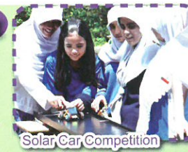
Solar Car Competition

It can arouse students' interest in Mathematics and Science subjects and help them to gain more practical experience. Activities organized during the week included Two Dollar Potato Chip, Maths and Science Quiz Competition and Solar Car Competition etc.