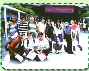
Visit City University

Visits to different universities and higher institutions have been organized for students to know the plentiful possible paths for their future and encourage them to study hard for it. Besides, career guidance teachers also took some students to Beijing Normal University in Zhuhai to visit our alumni to understand the possibilities of getting into the university.