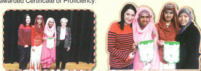
66th Speech festival, dramatic duologue champion winners

55 students participated in the 66th Hong Kong Schools Speech Festival, among which two pairs of them took part in the dramatic duologue section. All participants demonstrated enthusiasm and talent. With the intensive coaching by teachers and diligence of students, we have achieved impressive results. One pair of the students performed brilliantly and got the champion in the dramatic duologue section. One student came third, 36 students obtained Certificate of Merits and 13 were awarded Certificate of Proficiency.