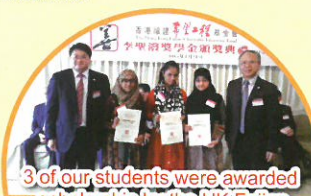
3 of our students were awarded scholarship by the HK Fujian Charitable Edu Fund