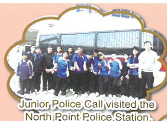
Junior Police Call visited the North Point Police Station.