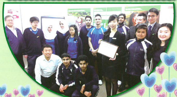
Visit Holiday Inn