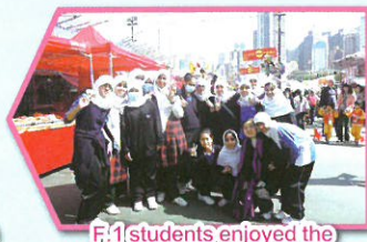
F-1 students enjoyed the New Year Fair in Victoria Park