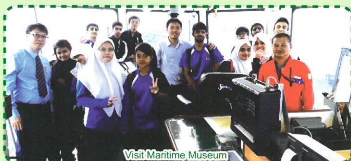
Visit Maritime Museum