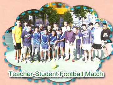
Teacher-Student Football Match