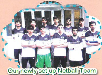
Our newly set up Netball Team