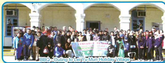
BBQ - Outing to Lei Yu Mun Holiday Village