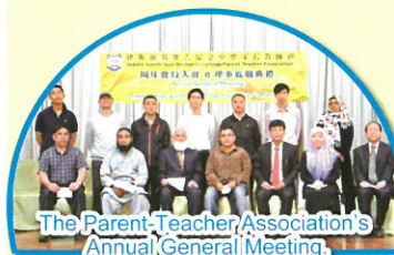
The Parent-Teacher Association's Annual General Meeting