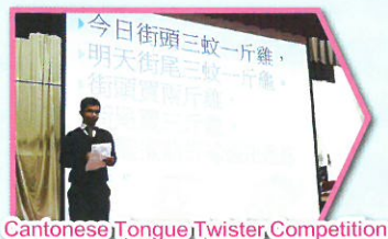
Cantonese Tongue Twister Competition