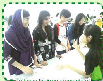
To know the requirements of HKIED Degree Programme

There are regular sharing sessions by alumni, especially those with similar background, about their post-secondary school experience and their kind advice to students. Alumni would have a close relationship with and good understanding of the current students.