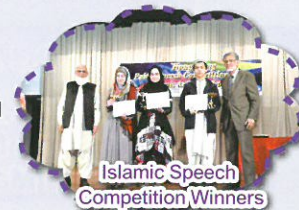
Islamic Speech Competition Winners