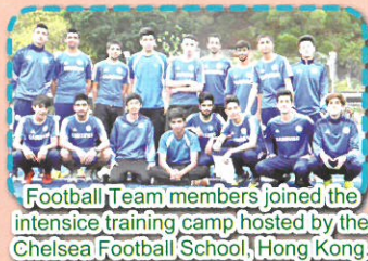
Football Team members joined the intensive training camp hosted by the Chelsea Football School, Hong Kong.

This year, our soccer team is privileged to join the year-round training scheme launched by the Chelsea Football Academy. Besides regular intensive training, members also took part in training camps and visits to the community to improve their skills as well as their understanding of sportsmanship.