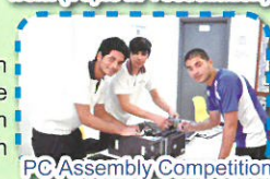
PC Assembly Competition