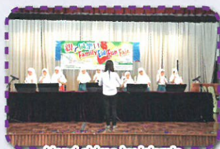
Hand chime by Islamic Dharwood Pau Memorial Primary School