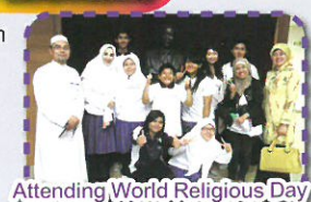
Attending World Religious Day