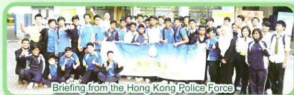
Briefing from the Hong Kong Police Force

approach to achieve this objective. Working together with Form Management, other committees and external organizations, a variety of activities were organized for the whole-person development of our students.