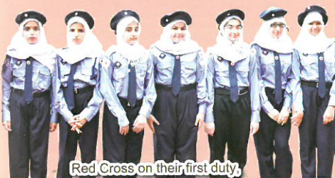
Red Cross on their first duty, serving in the Sports Day

Whole person development has always been a major focus of the Colleges' curriculum. We aim at encouraging students to develop and explore diversified interests and cultivate different hobbies so they can realize their potential. Nearly 50 interests groups, clubs, and teams are set up this year, including the newly set up Red Cross and Junior Police Call. The aims of these activities are to cultivate a healthy and active life style for students. We hope to extend classrooms learning and let students have balanced development in physical, aesthetics, intellectual and social dimensions.