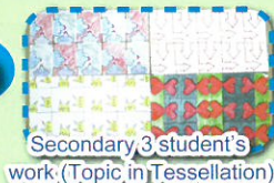
Secondary 3 student's work (Topic in Tessellation)