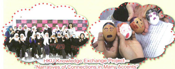
HKU Knowledge Exchange Project - "Narratives of Connections in Many Accents"

Project entitled "Narratives of Connections in Many Accents" organized by the Department of Comparative Literature of the University of Hong Kong (HKU) in March 2015. HKU lecturers and students conducted a workshop on writing short stories for S4 students, exploring the diverse cultures and languages of our city. Students were encouraged to reflect on meaningful connections they have made in their lives that involve differences in cultural background, family experience, age, religion, work etc, and how these connections have broadened their horizons. Students then produced pieces of creative writing on the topic, which would be posted on the HKU "Narratives of Connections in Many Accents" website from June 2015 onwards.