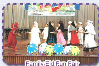
Family Eid Fun Fair Performance by Students from Abu Baker Chui Memorial Kindergarten

The occasion was honoured with the presence of officials of the police department and representatives of Madrasahs, Muslim organizations and Islamic schools. The programme included game stalls, group activities, snacks, cultural shows, rock climbing, big sales, etc.