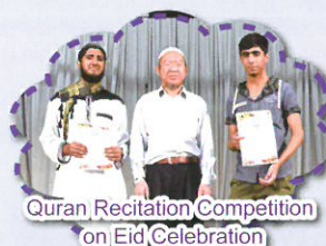
Quran Recitation Competition on Eid Celebration