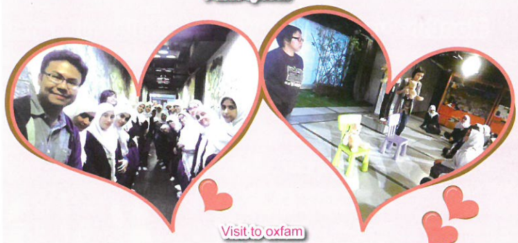
Visit to oxfam